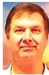
Director Pan America