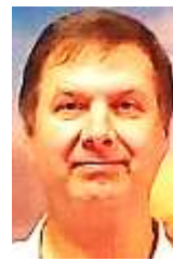
Director Pan America