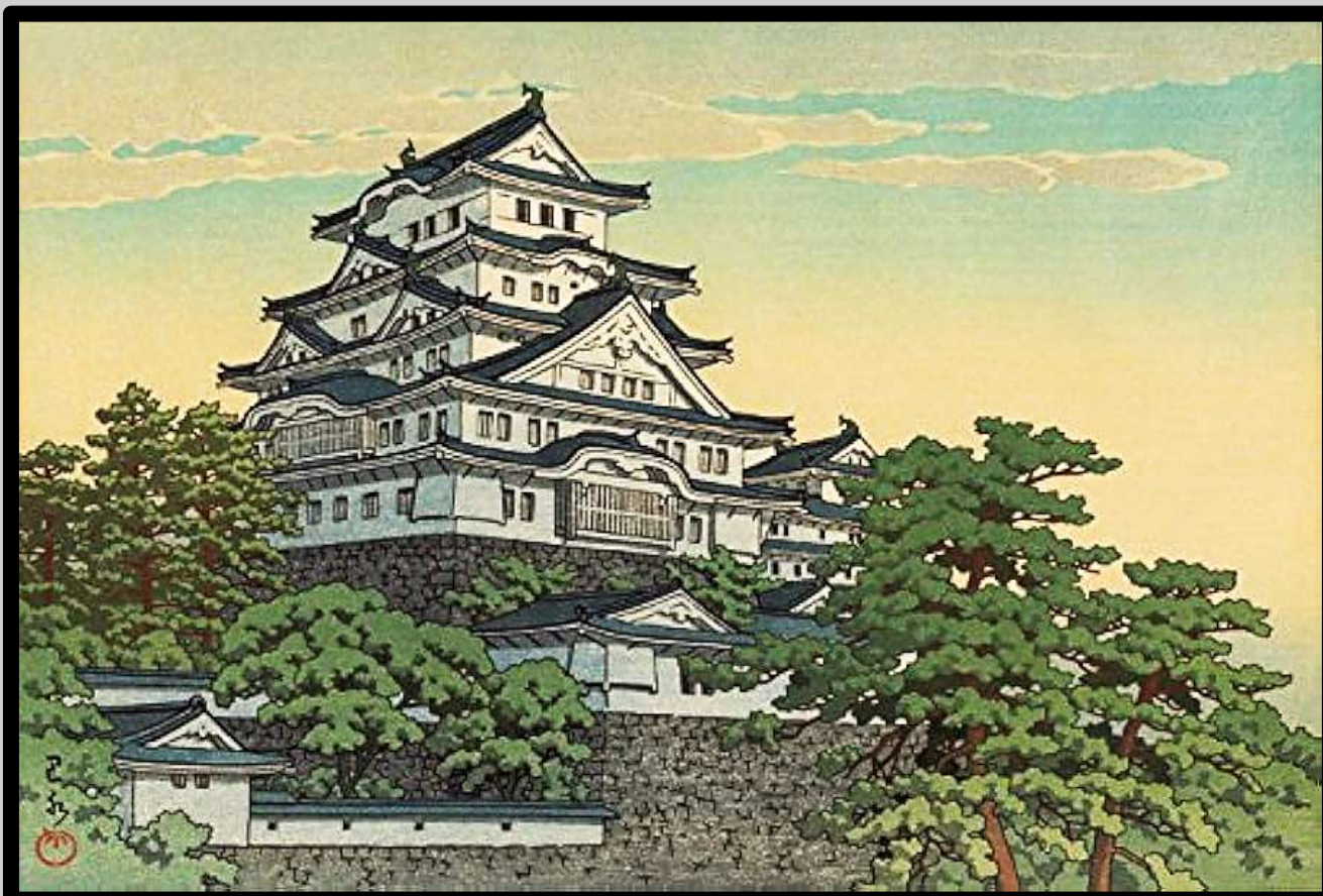
Kawase Hasui: Himeji Castle